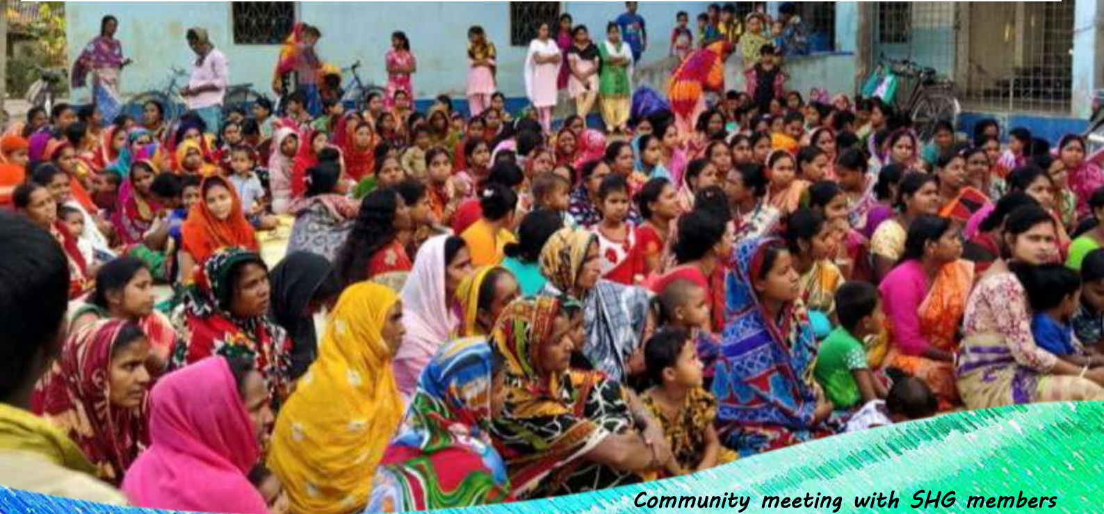
Community meeting with SHG members

Rupantaran constructs a safe space for adolescent and youth to promote dialogue, enhance understanding and facilitate actions to challenge the patriarchal norms and gender construct. Other than conducting structured sessions on gender-based discrimination and violence, basic understanding of patriarchy, masculinity and sexuality with both girls and boys, Rupantaran also promotes gender sensitive community through dialogs, rallies, mass awareness programmes.