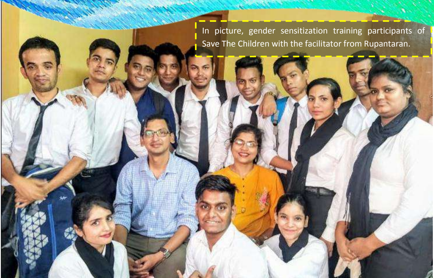
In picture, gender sensitization training participants of Save The Children with the facilitator from Rupantaran.

This year Rupantaran has collaborated with Save the Children, India and CREA as their resource partner in building capacity of their project participants on gender equity and how to use comics as an intervention tool.