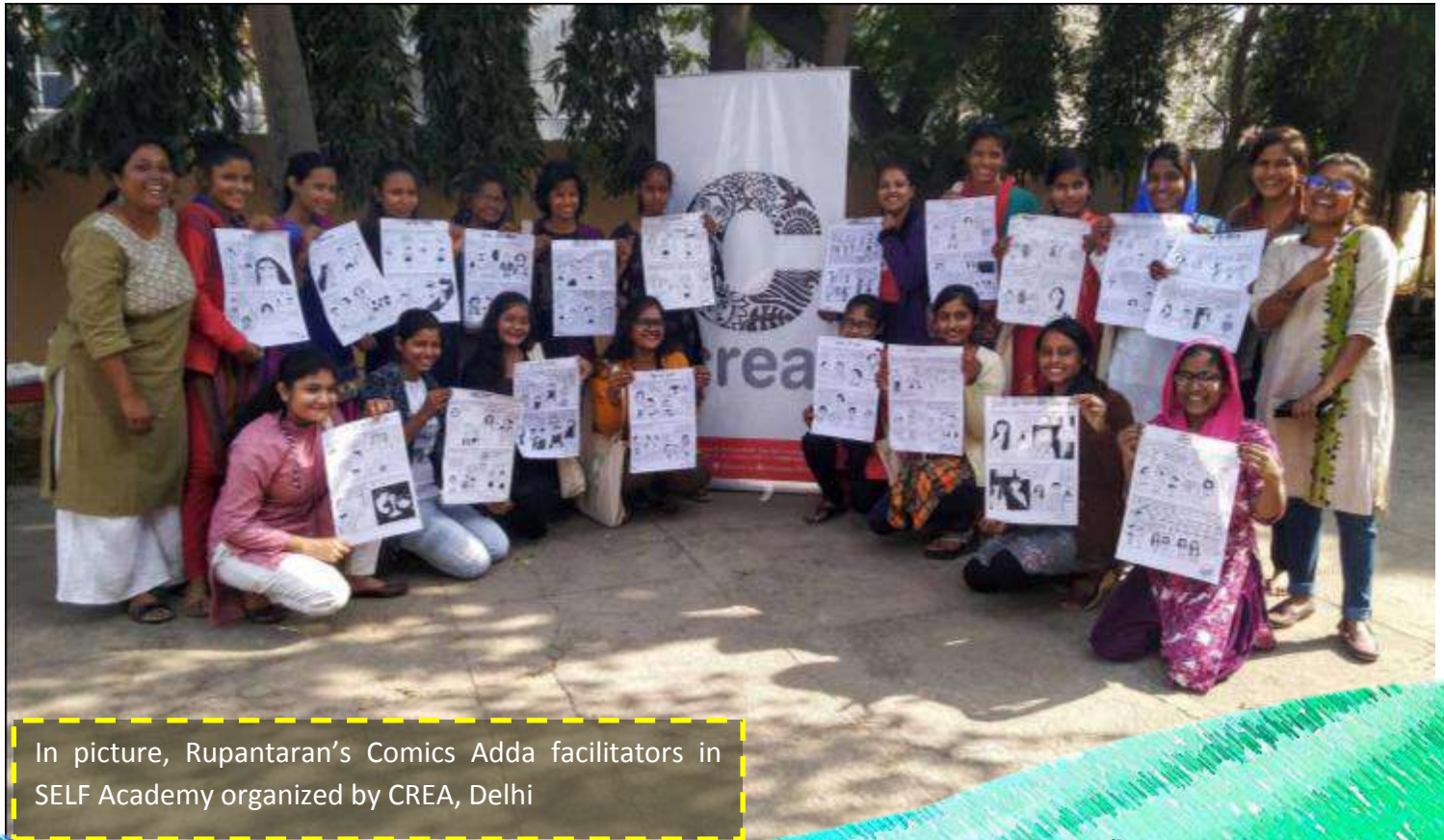
In picture, Rupantaran's Comics Adda facilitators in SELF Academy organized by CREA, Delhi